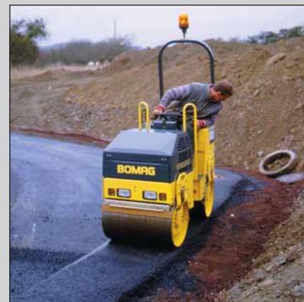
BW 80 AD-2: Operation in restricted conditions; asphalt repairs, carparks

For situations where a roller is being used close to obstructions, we recommend our clear sided vibratory roller, the BW 80 ADS. This unique roller, with conical drums at the rear, allows for efficient operation right up to walls without damaging them. Nor is there