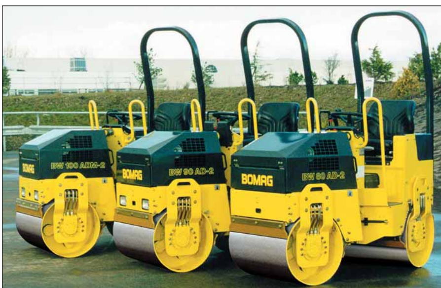
BW 80 AD-2, BW 90 AD-2, BW 100 ADM-2

All the rollers meet the international safety regulations for moving roadbuilding machinery. Among the safety elements used are seat contact switches and automatic spring-loaded brakes, while every BOMAG roller is fitted with an obligatory emergency stop switch. All rollers are well prepared for regular transport, and can be safely suspended and loaded with a choice of single-point lifting device.