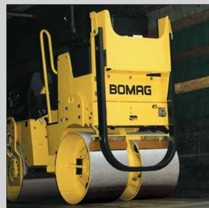
The folding ROPS make transport easier