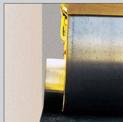
Three tools for multifunctional tasks; the conical drum provides complete compaction, right up to the wall