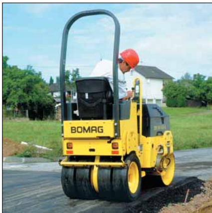
BW 90 AC-2: Compacting and sealing in one pass

The BW 90 AC-2 combination roller is a member of the same family. It combines powerful vibration at the front with rubber tyres on the rear axle. This guarantees ideal sprinkling performance on asphalt surfaces and gives added value on pressure-sensitive asphalt mixtures and rolling operations on gradients.