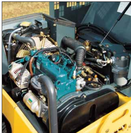
Optimum access to all the components in the engine compartment

BOMAG provides local service and support no matter where your next contract is located.