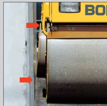
BW 80 ADS up against the wall: No damage, no follow-up working